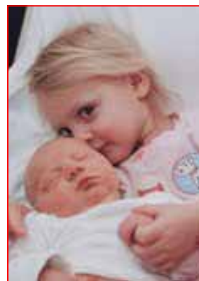
FUTURE RIDER & CO-RIDER